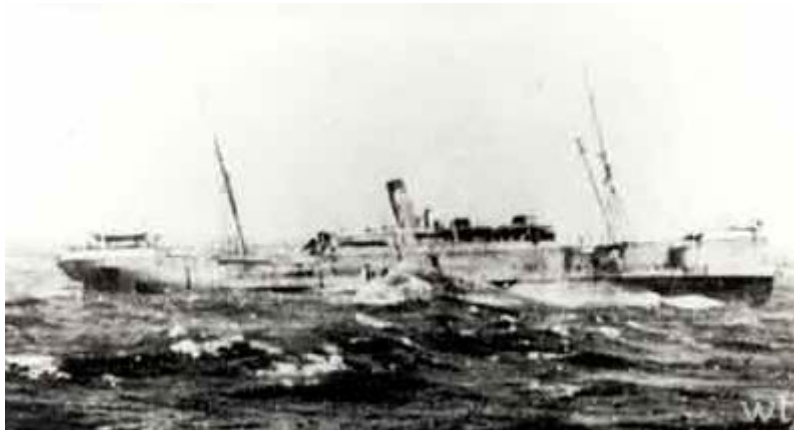
Figure 2 : Somali in heavy seas

the foremast called down "three ships approaching." The Cape Squadron had arrived, only to discover Königsberg steaming out to sea. All three British cruisers, HMS Hyacinth , HMS Pegasus and HMS Astrea converged their courses on the Königsberg and took up station around her. If word of war came now, Königsberg would be in serious trouble. Captain Looff could only order steam for 22 knots and wait. Not long after, a squall blew in from the southwest and blanketed Königsberg with a driving warm rain, hiding all three of her unwanted escorts from view. The German cruiser whipped into a 180 degree turn and sped back toward the British ships. As she cleared the squall, Königsberg passed the Hyacinth , which was already making heavy smoke as she tried to bring up steam for full speed. Captain Looff turned south for one hour and then headed at full speed out to sea for the rest of the night, burning tons of valuable coal in the process. British Admiral King-Hall was left to his own fury at letting the cruiser escape from under his very nose, and Captain Looff waited for war in a cruiser already looking for more coal to fill her bunkers.