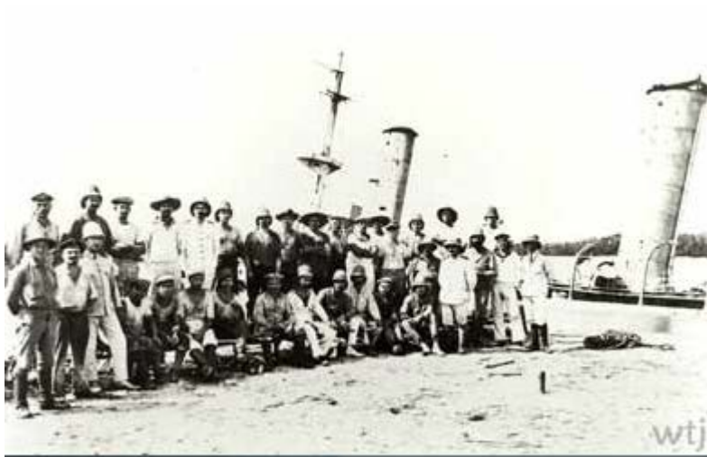
Figure 6 : Königsberg salvage crew 1915