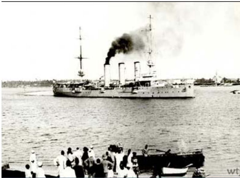
Figure 1 : Königsberg at Dar es Salaam

The story began before the war when the German government decided to post a modern cruiser to their East African colony. In 1913 this area of the continent, which today is the country of Tanzania, was controlled by a surprisingly enlightened civilian administration. They did not view the Africans as inherently inferior, and this not-so-subtle distinction dramatically affected the course of war time events within the colony. As a key component of colonial policy, Königsberg helped to enhance the status of German East Africa with its capital of Dar es Salaam, and reinforced the German Navy's ability to conduct commerce warfare in the case of war. This last item was not lost on Great Britain, which was keenly aware of the German colony's proximity to major shipping routes.