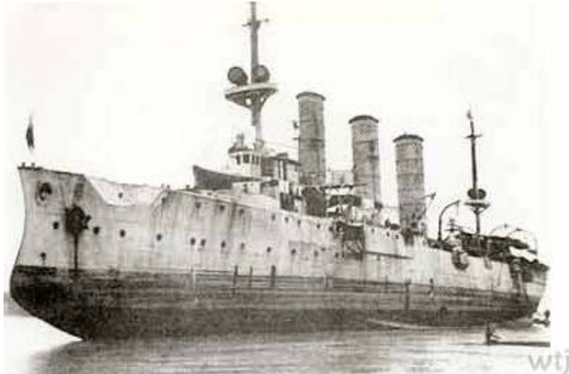
Figure 4 : Königsberg at low tide in the Rufiji

On November 2, the three British cruisers zeroed in on what they now knew to be the German ship's masts and fired throughout the day. No targets were hit but Looff moved his flotilla two miles further upstream as a precaution. Several days later Chatham scored several hits on Somali during the course of a general attack. Somali soon began to burn and eventually became a total loss. On November 9 the mouth of the Ssuninga Channel was blocked when the British sank the freighter Newbridge there in a daring raid. In reality this last action had little effect on events, as Königsberg never acquired adequate quantities of coal to make a run for the sea.